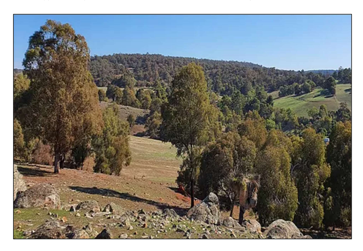
Figure 1. Crown Project located ~70km NE of Perth, WA.

Oar Resources Limited ("Oar" or "the Company", ASX: OAR) is pleased to announce that it has commenced field work at its 100% owned and underexplored Crown Project, located in the Julimar district, approximately 70km northeast of Perth in Western Australia ( Figure 1 ).