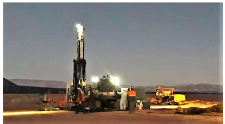
Figure 2: Location of Kachi Project drillholes – past and planned. Drilling to upgrade resource at Kachi Project.