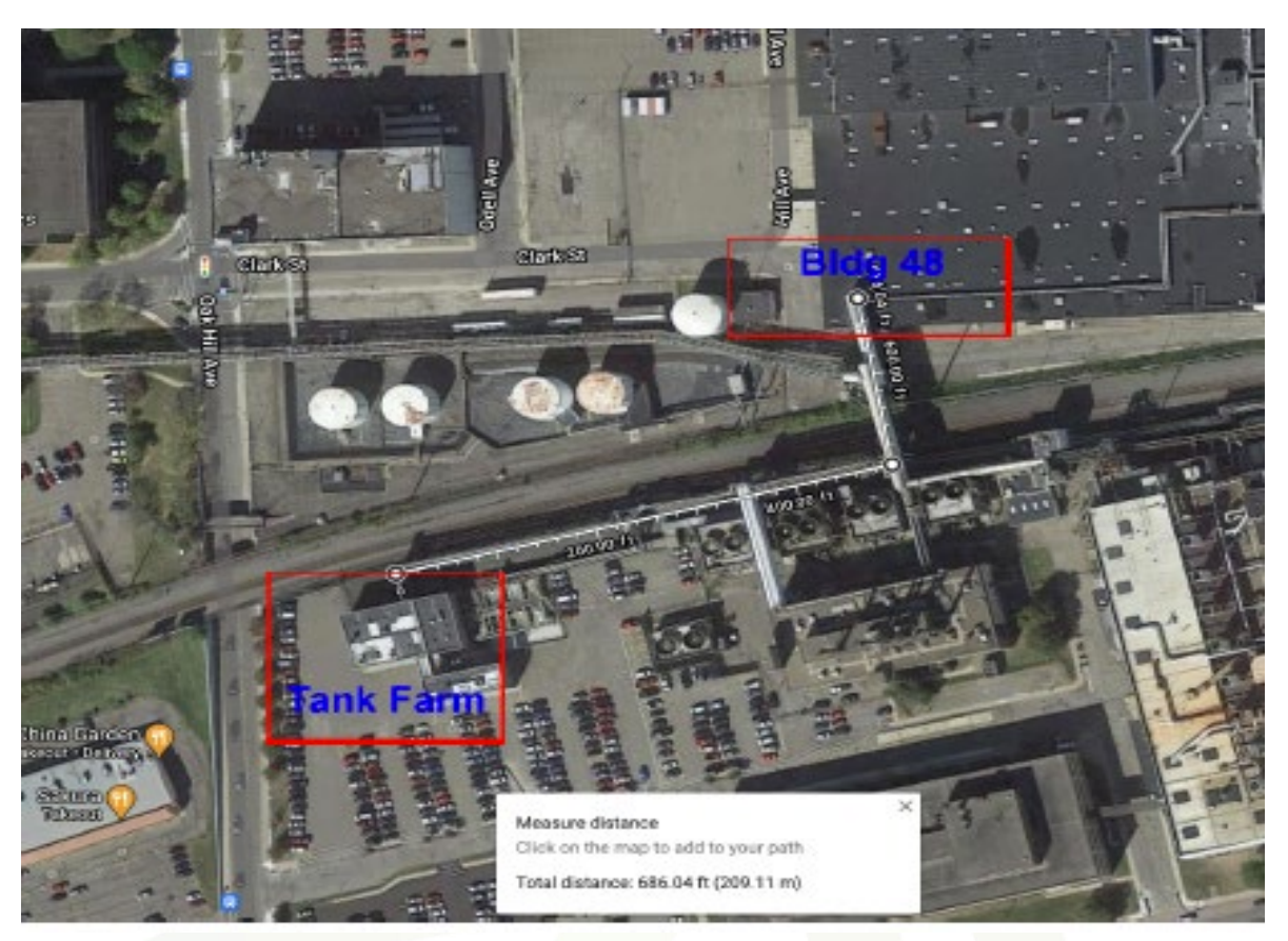
Figure 3: Tank Farm location and building 48 represent the Gigafactory site