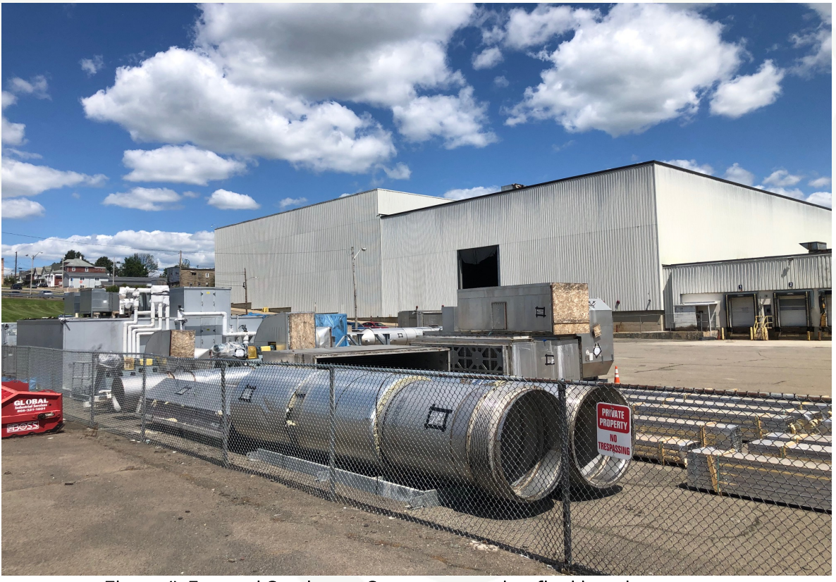
Figure 4: External Condenser Systems moved to final location