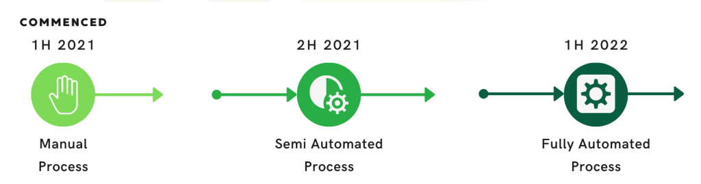
Figure 1: Timeline of various production stages

There have been zero safety incidents in June and July.