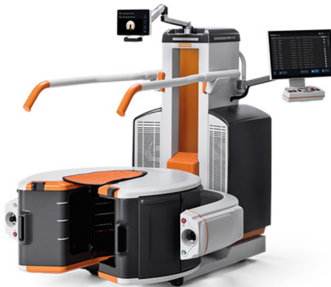
Carestream InSight 3D Digital Radiography System

During 2020, Quantum acquired the service businesses of Carestream in Australia, New Zealand and Philippines which significantly increased our service install base to over 3,500 systems. This also contributed to the shift to a higher gross margin service model.