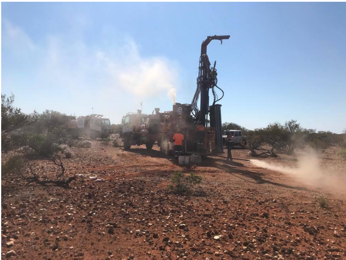
Figure 1: Aircore Drilling Rig at the Shadow Prospect of the Austin Gold Project.

Silver City Minerals Limited (ASX: SCI ) is pleased to announce the commencement and mobilisation of air core drilling at the Shadow target area. The air core drilling program will comprise a total of 4,000 m of drilling and is expected to be completed by late September.