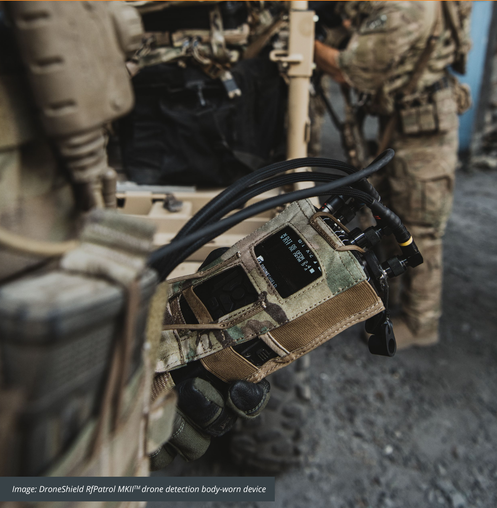
Image: DroneShield RfPatrol MKII™ drone detection body-worn device