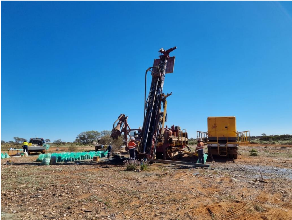
Figure 2: RC Drill Rig at the Austin Gold Project.

Importantly, recent interpretation by the geological survey indicates that the majority of gold occurrences including the Mt Sandy , Brians and Brunswick Hill prospects occur on the eastern limb of the regionally folded highly prospective Norie Group rocks within the Mt Magnet Greenstone Belt (Figure 1). The extensive package held by Musgrave Minerals, including the Break of Day and Lena group of gold resources, occur on the western limb of the Norie Group. A number of new discoveries have been made by Musgrave Minerals including the high-grade Starlight , White Light , White Heat and Big Sky structures that have been shown to trend northwest ( Musgrave Minerals ASX Investor Presentation dated 14 December 2020, 1 February 2021, 19 March 2021 and 18 June 2021 ). These structures have provided a breakthrough new understanding in the controls of the mineralisation in the district. Importantly, these northwest controlling structures are interpreted to project under cover onto the Austin Gold Project license (Figure 1). For more details on the Austin Gold Project, including several new high-grade assays on rock samples and previous drilling intersections refer to SCI announcements dated 7 th , 12 th and 19 th April 2021.