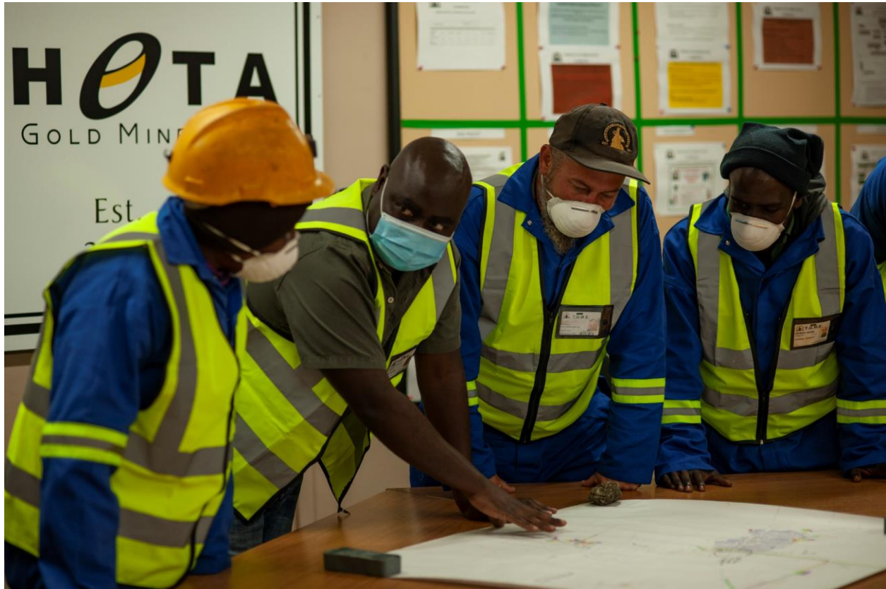
Figure 5: Underground sampling crew reviewing mine plans for Beta South Mine Complex