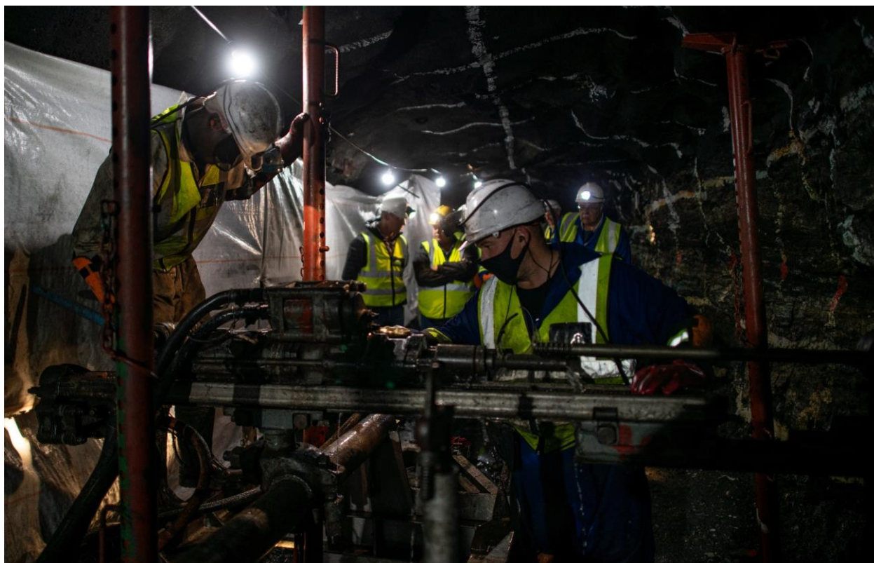
Figure 2: Frankfort underground drill rig being installed

Extensive underground sampling is also underway to assess the Beta South Mine ore body and other potential zones of mineralisation. These results will be instrumental in Theta upgrading its Mineral Resource Estimate (MRE).