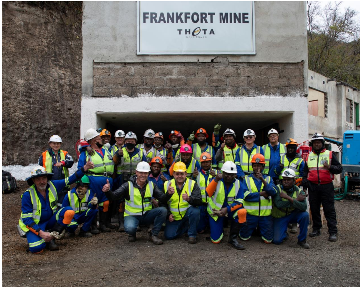
Figure 10 Underground Mining Team

In support of the Government's COVID-19 vaccination roll-out, the Company arranged for employees to receive vaccination at the mine (see Figure 9 ). The employees embraced this initiative with 99% of all employees now vaccinated.