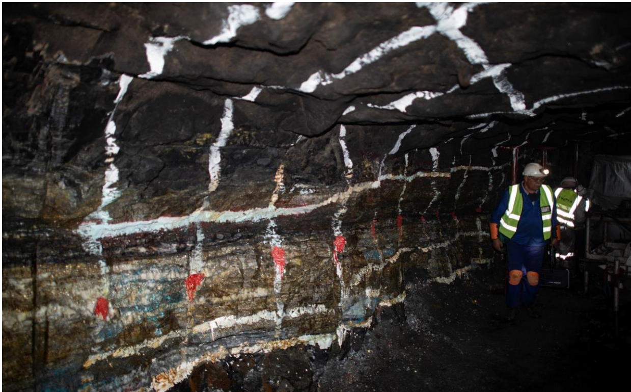
Figure 3: Gold reefs being Mark up to for trial mining

In September 2021, the Board authorised management to commence trial mining at Frankfort. In order to commence with the trial mining programme, the closed Frankfort Gold mine was selected as it has the necessary permits in place and offers easy access to the reef through an extensive network of underground tunnels and developments adits. The upfront site work required for mining, such as making safe and installing necessary stope support and lighting was completed timeously and has resulted in trial mining commencing.