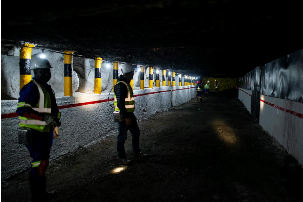
Figure 7: Team installing new supports and marking out Frankfort Mine in preparation for Trial mining

where the span was found to be excessive and would require additional support in the form of interlocking packs. The support design recommended by the rock engineer will be used to support the area before the commencement of rock drilling activities.