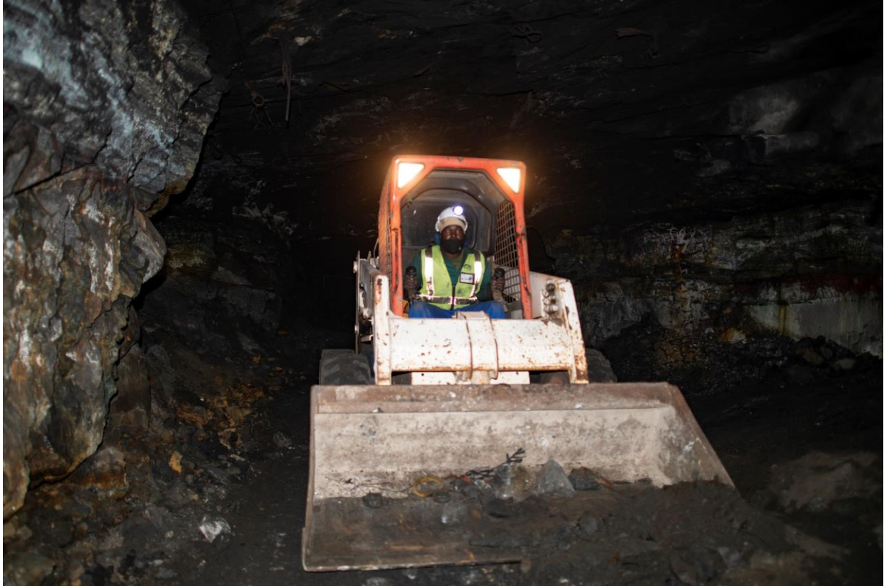
Figure 4: Underground haul way clean up at Frankfort Mine

Due to the long lead time for delivery of the Sandvik Longhole DL230L drill rig, the Company acquired a modified S36 machine (see Figures 2 & 3 ). This machine will be able to drill the desired holes and, most importantly, the acquisition prevented operational and potential delays to the DFS. Holes of varying depths (up to 22 meters), and spacing of 0.6m, will be drilled to determine an effective drilling depth and diameter. This will allow the Theta team to determine a drilling pattern and mining layout that gives optimum fragmentation of the ore and allowing for effective use of explosives, support, labour, and other consumables. The drilling rig is operated by trained and skilled operators.