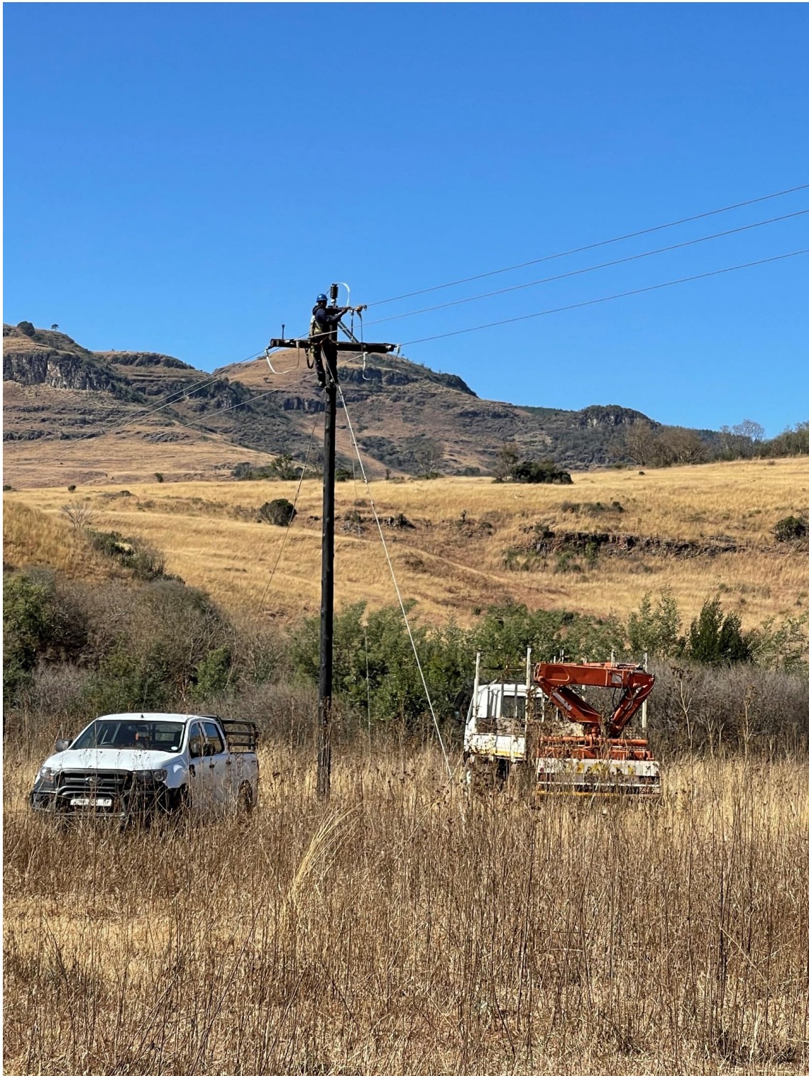
Figure 11– New power line installation across the Northern section of our Mining Rights (Close to Vaalhoek and Frankfort Mines.) The powerline will add to the required capacity for the new gold plant and extends from north to south over 20 km within the current Mining Rights area.