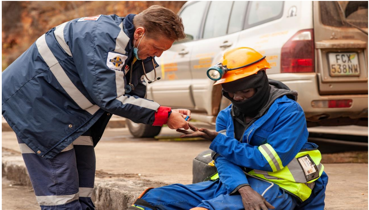
Figure 8: First aid support and training

Additional personnel that will be utilised for the duration of the trial mining were sourced from the community in Pilgrim's Rest. Over and above the mandatory medical screening, individuals were required to provide proof of vaccination for Covid-19. The individuals were then put through the mine's recruitment process which includes initial training covering the Company's policies, the Mine Health and Safety Act and its requirements, basic strata control and general hygiene and environmental training.