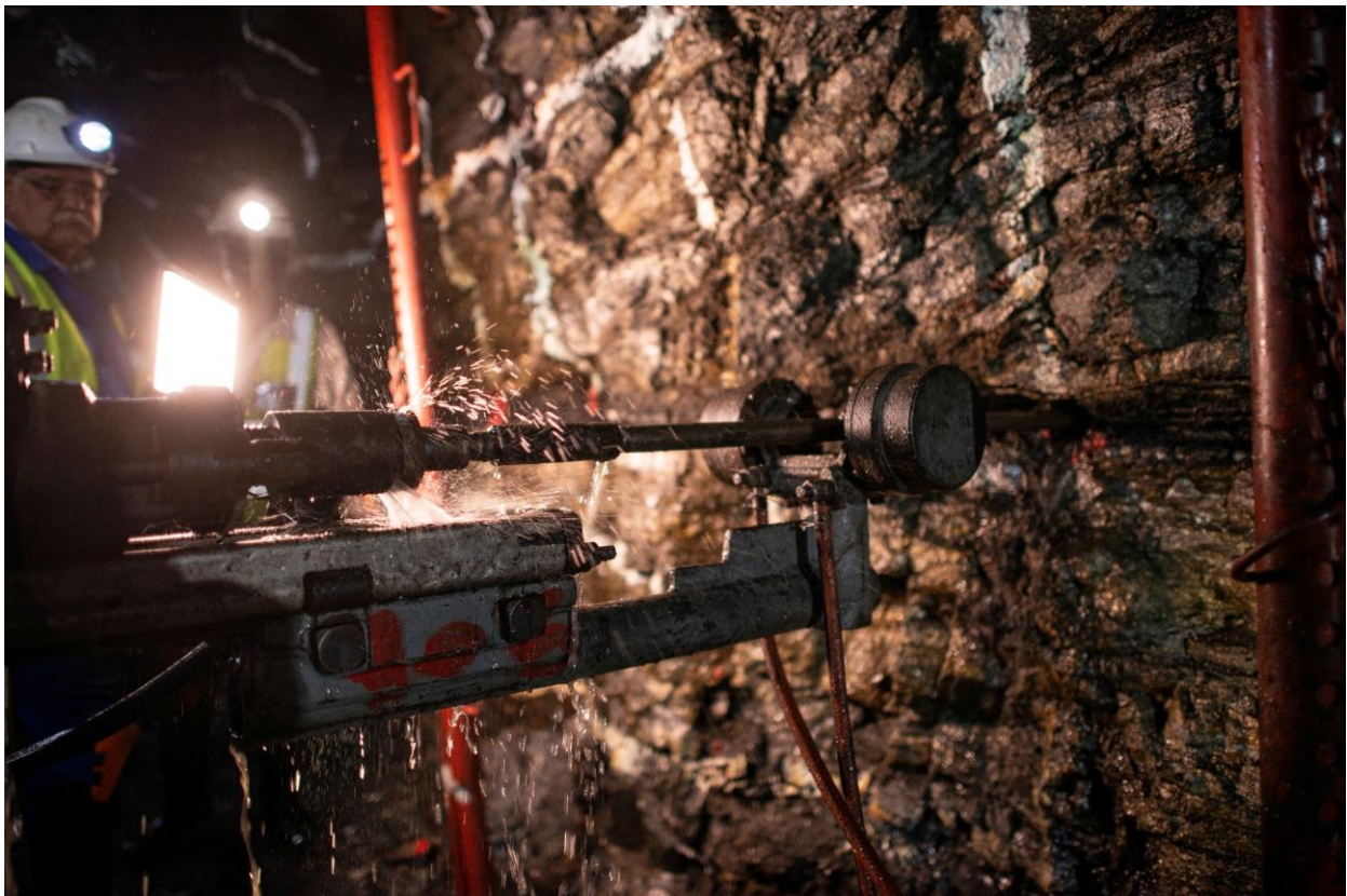
Figure 1: Frankfort underground trial mining drilling