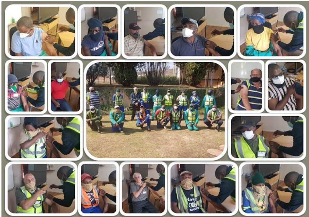
Figure 9: Workers at the TGME plant & mines receiving Covid-19 vaccinations

Additional personnel that will be utilised for the duration of the trial mining were sourced from the community in Pilgrim's Rest. Over and above the mandatory medical screening, individuals were required to provide proof of vaccination for Covid-19. The individuals were then put through the mine's recruitment process which includes initial training covering the Company's policies, the Mine Health and Safety Act and its requirements, basic strata control and general hygiene and environmental training.