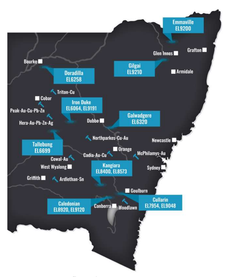
Figure 4: SKY Location Map

SKY has been granted two exploration licences in the New England Orogen covering areas of significant historical tin production – Emmaville & Gilgai. These areas were selected as they were considered to have considerable potential to host hardrock tin resource and limited modern day exploration has been conducted.