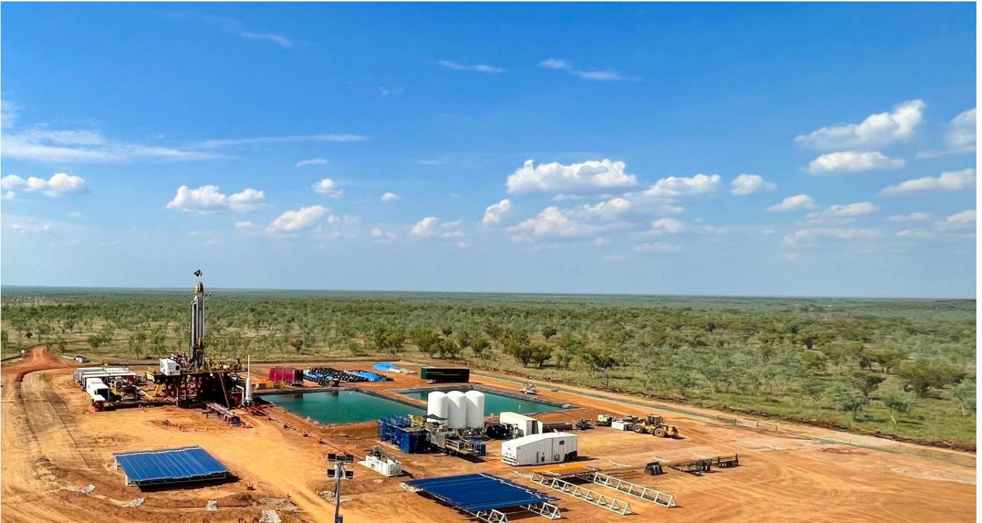
Silver City Drilling Rig 40 at the Carpentaria-2H well pad

This ASX release has been authorised by the Managing Director