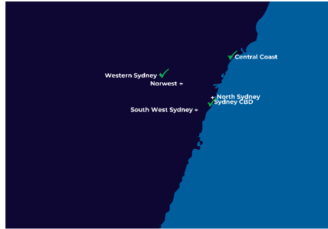
NSW Target Tuck-in Locations: 6 (completed: 3)