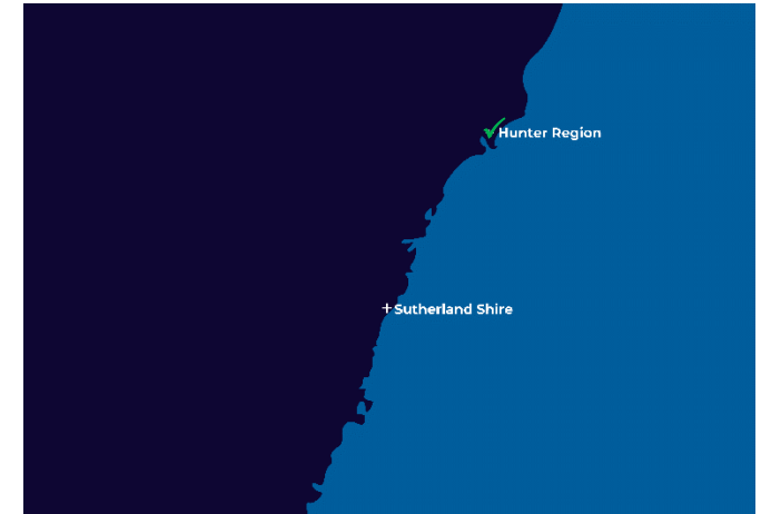
NSW Target Marquee Locations: 2 (completed: 1)