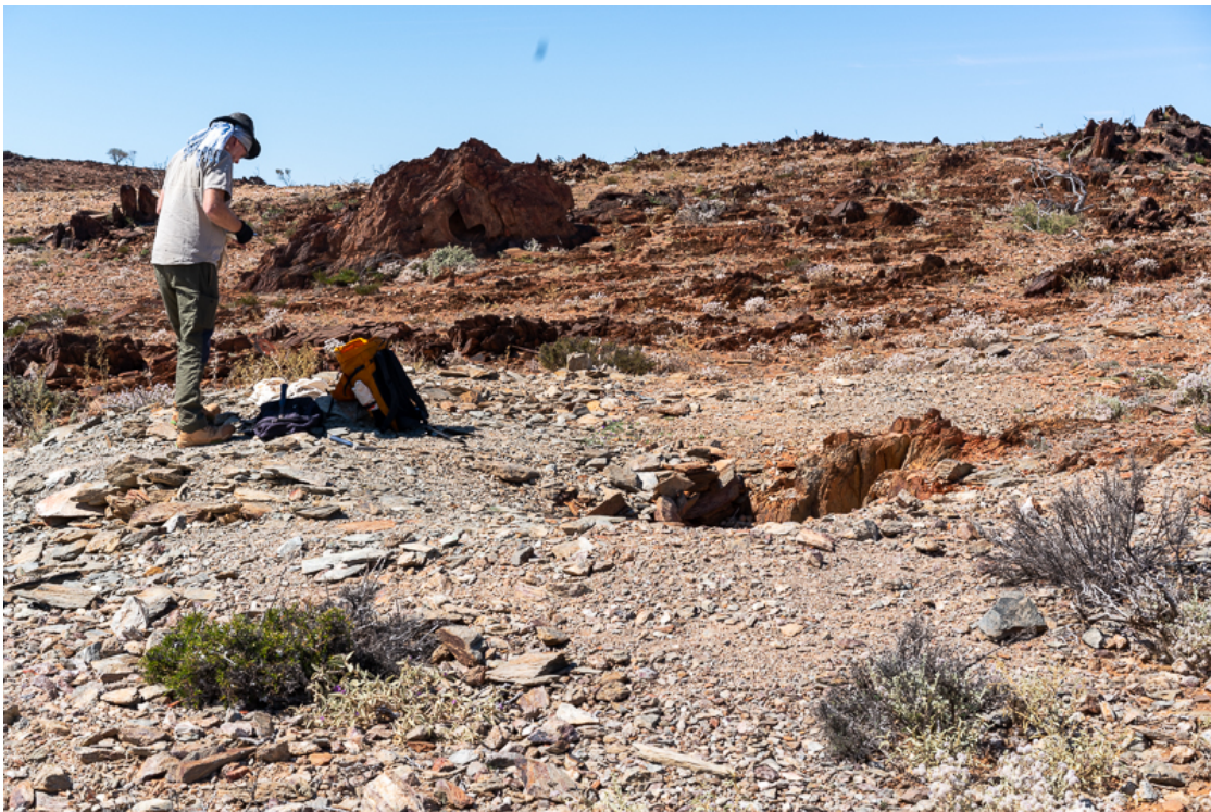
Figure 4: Horrie Hoars Gold Mine which returned the 1.275g/t Au sample from 558881mE 6520483mN

Significant results from all of the 152 rock chip samples received are shown in Table 1 and 2. Table 1 shows the base metal results and Table 2 shows the critical metal results.