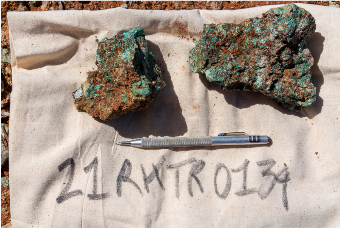
Figure 3: Horrie Hoars Gold Mine. Malachite & rare azurite in Pelite from location 556979mE 6515472mN 556979mE