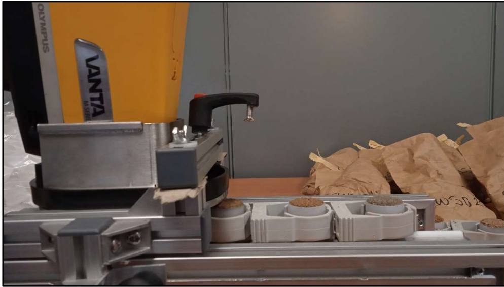
Figure 4: Crown Project - P-XRF analysis in progress

“This Announcement has been authorised for release to ASX by the Board of Oar Resources Limited”