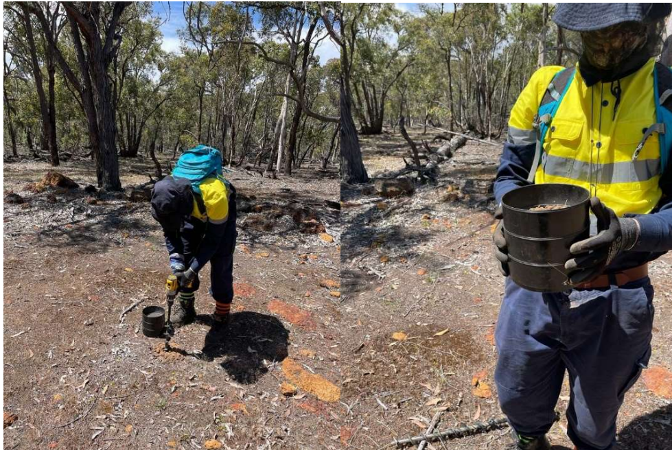
Figure 1: Soil Sampling, OAR Crown Project - Chittering

Petrological analysis from the rock chip sampling program has confirmed the presence of ultramafic amphibolite rocks containing copper sulphides – confirming the presence of the targeted host rocks at the Crown Project (ASX announcement, 5 October 2021).