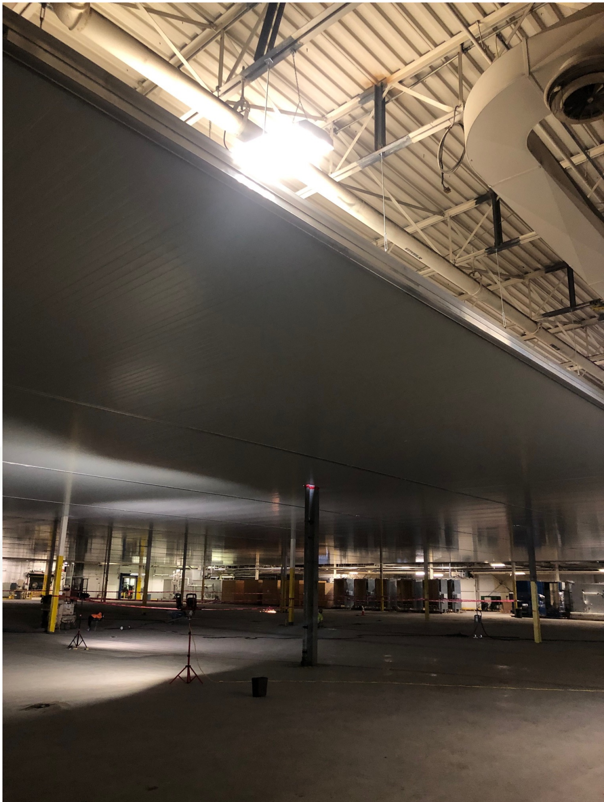
Figure 2: Dry Room Ceiling Plenum installed