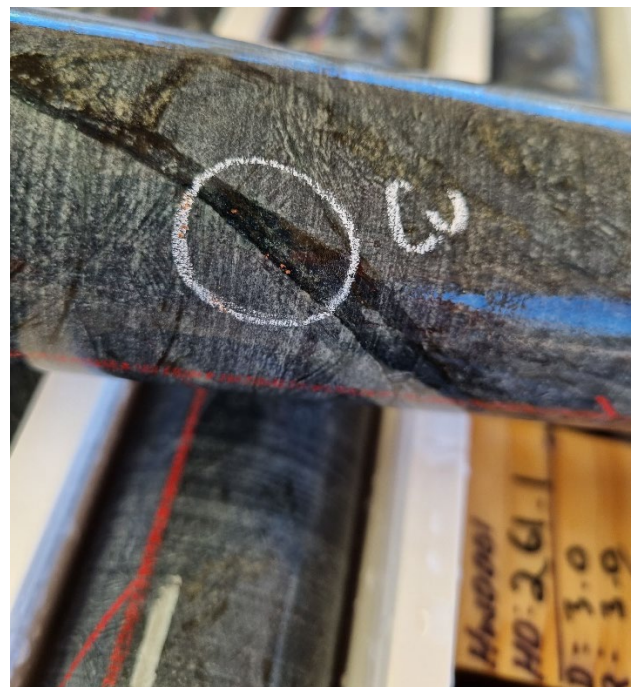
Figures 3 & 4 – Native copper in chlorite-rich veinlets (NQ diamond core) at 255m and 260m.

A thick metasedimentary unit was intersected at the end of the hole (Figure 1) with significant disseminated pyrrhotite concentrations. This unit became more carbonaceous with depth, and the DHEM results suggest this is the dominant conductor in the area. Small intervals of fuchsite + pyrite altered metasedimentary rock were observed at the end of the hole, analogous to mineralization intersected in shallow RC holes to the south (ASX:MXR announcement 22 July, 2021). At this stage, it is not resolved whether this alteration is associated with the intersected structure in the RC drilling, or is a parallel feature.