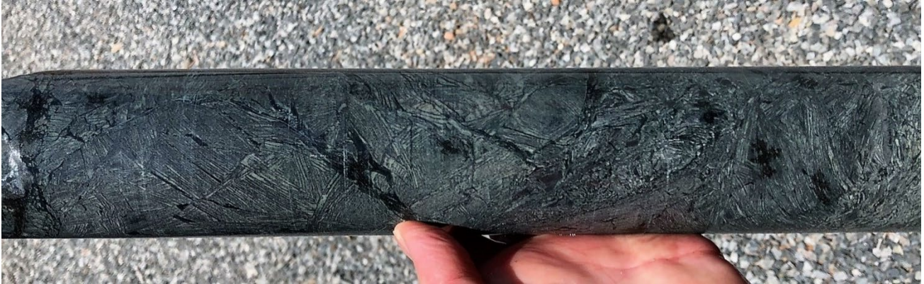
Figure 2 – Spinifex textured komatiite (HQ core) indicating proximity to the top of an ultramafic lava flow, assisting in identifying the number of flows intersected downhole.