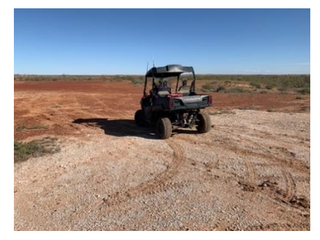
Figure 2: Buggy loaded with radiometric survey equipment

Adavale acknowledges the Dieri as Traditional Custodians of the land on which our current works are located. With respect to Elders past, present and emerging, Adavale is committed to conducting its activities with utmost respect to the communities in which it operates.