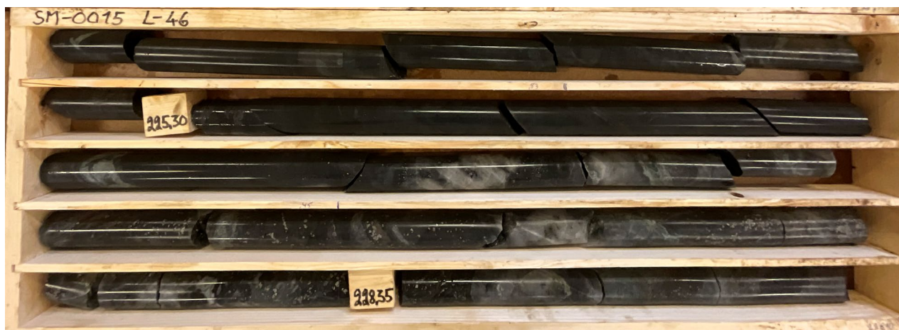
Figure 3: Drillhole SM0015 zone of silica alteration and arsenopyrite – good indicators for Gold

The NewPeak suite of tenements within the Somero and Forssa areas, around Satulinmaki, cover close to 2,500ha of ground. These tenements are host to multiple Gold targets at various stages of development with multiple high grade rock chip and boulder samples returning up to 77g/t Gold 1 . It is NewPeak's intention to further develop these targets in 2022, which will provide multiple opportunities to unlock the potential of this area.