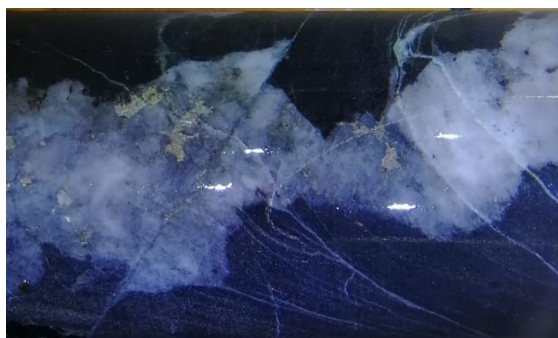
Figure 4: Drillhole SM0017 at 77m. Example of quartz veining with sulphides intersected in drill hole (scale: image length is ~10cm of drill core)

This Announcement has been authorised by the Board of Directors.