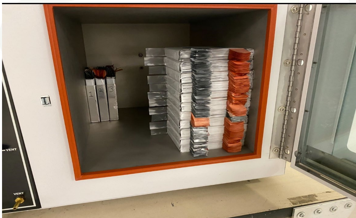
Figure 3: Production cells drying out ahead of cell assembly and testing