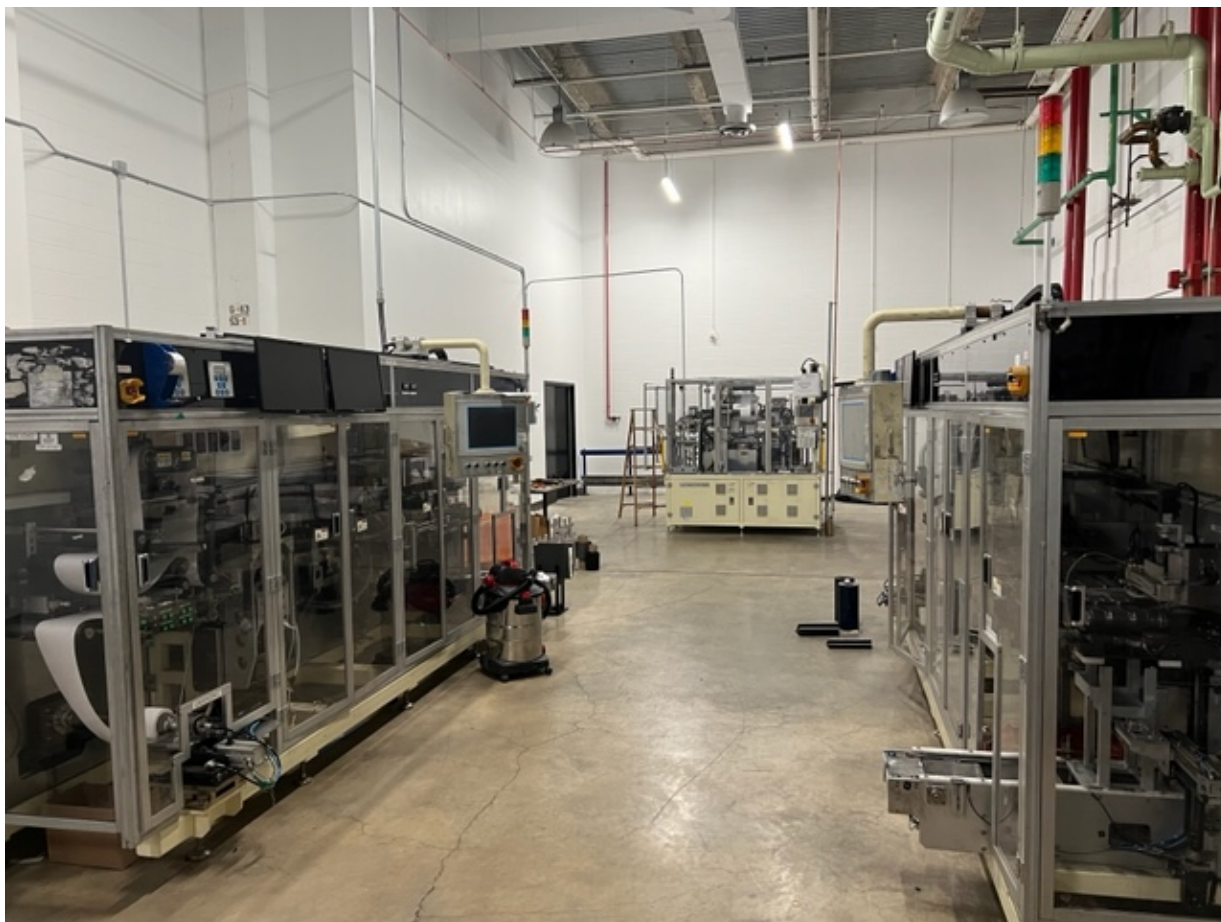
Figure 2: Stamping and Stacking machines help with the stack making process