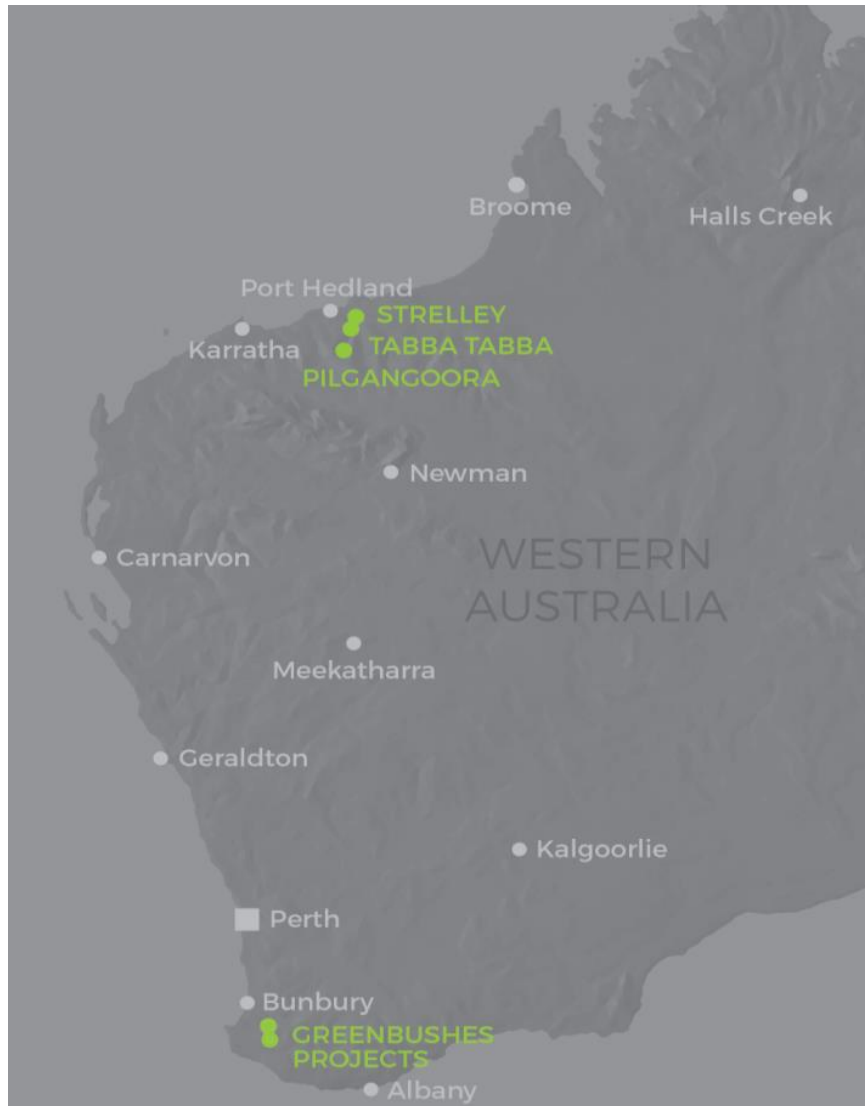
Figure 1: Location of LPI's properties in the Pilbara and SW regions of Western Australia; work recently completed at Greenbushes Project and at Pilgangoora