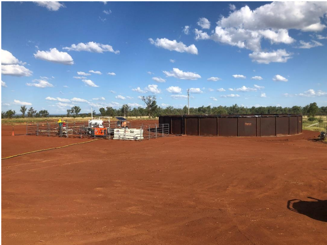
Figure 2: Mahalo North 1 well pad with water storage tanks and well test facilities installed, where the production test has recently commenced.