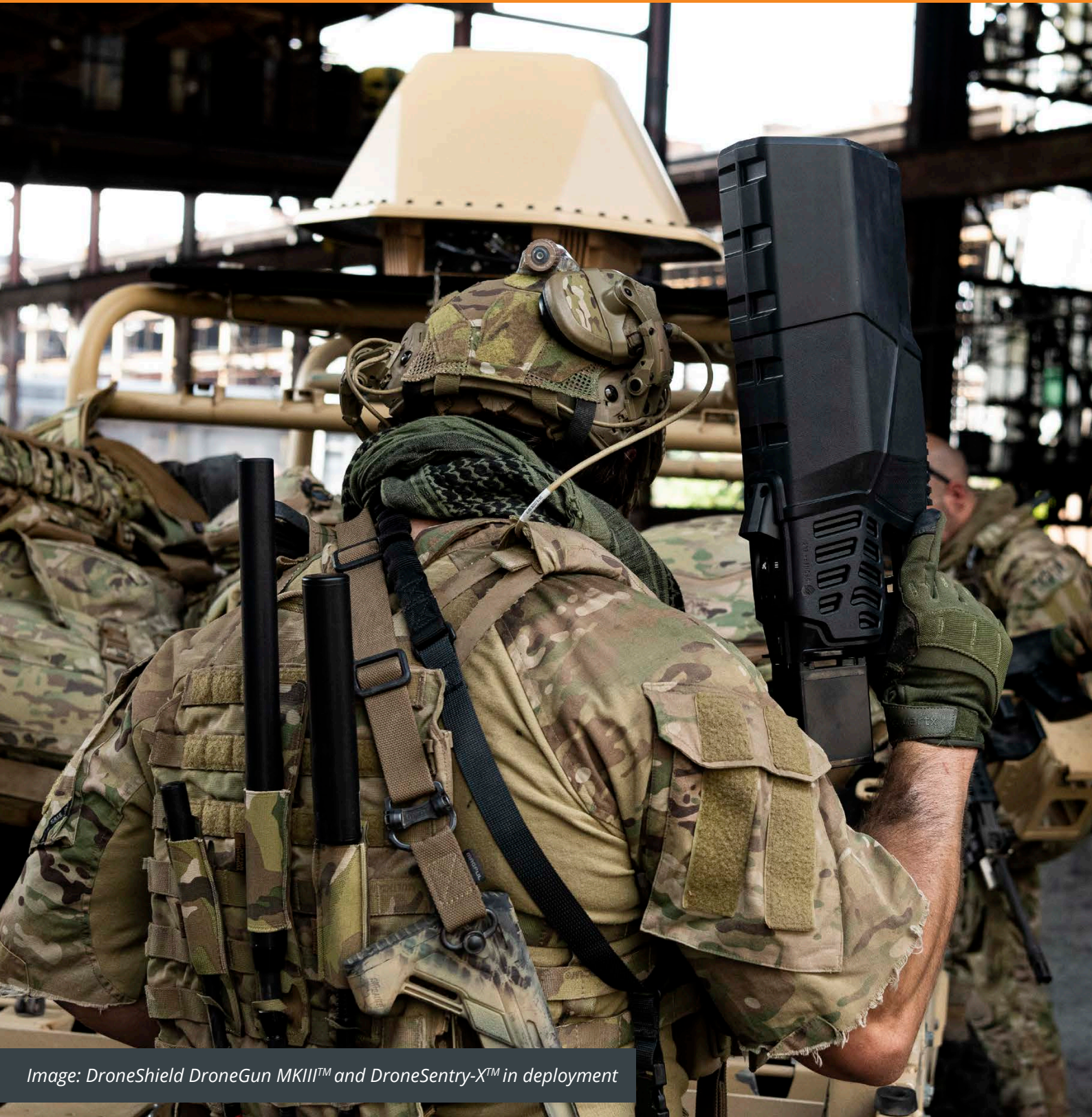
Image: DroneShield DroneGun MKIII™ and DroneSentry-X™ in deployment