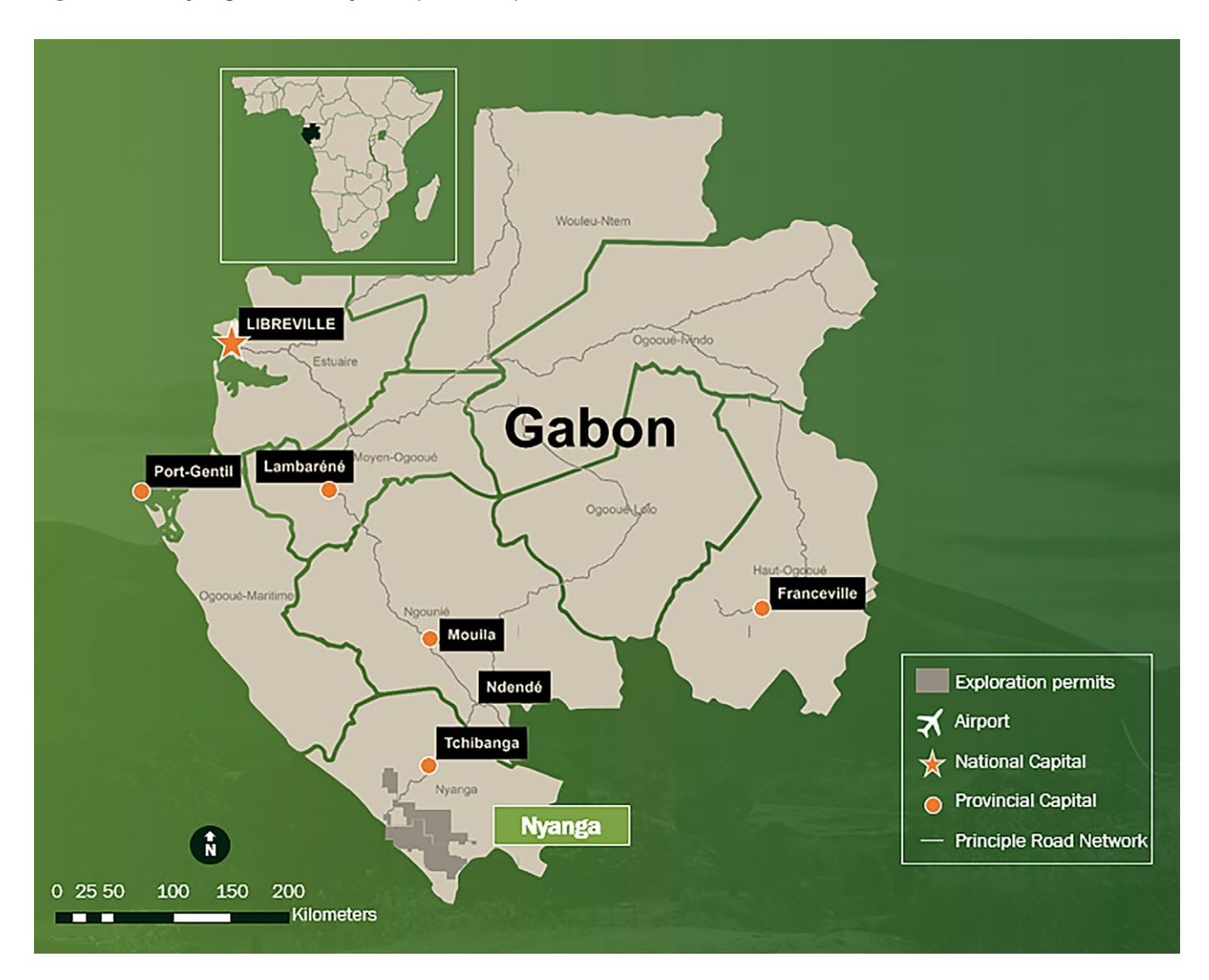
Figure 1: The Nyanga Ni-Cu Project exploration permits

Armada plans to drill test high-priority electromagnetic conductors positioned along the 25km strike of the Libonga-Matchiti Trend ('LMT'). The LMT has never been previously explored for nickel and copper.