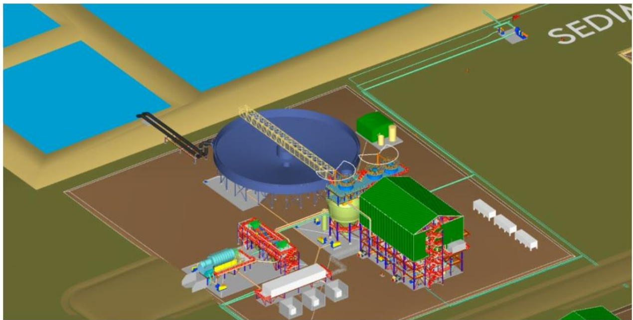
Figure 1. Donald Project 3D design of wet concentrator plant (WCP) layout.

production utilisation levels of key parts of the process. Project flowsheets and design concepts were evaluated to identify areas where efficiencies could be made, for example in product handling and logistics functionality. Attention was also focussed upon the means to reduce off-stream production time through various means including product diversion points and by stockpiling feed for downstream circuits in the event of unforeseen outages or during scheduled maintenance programmes. These flowsheet and design enhancement considerations have been deliberately built into the design stage before moving to the full of DFS design phase.