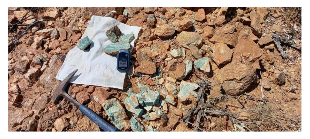
Figure 5. Detail of mineralised outcrop. (Sample# ZEU016 = 1.4% Cu, 0.19% Pb, 125 ppm Zn & 18.4 ppm Ag)