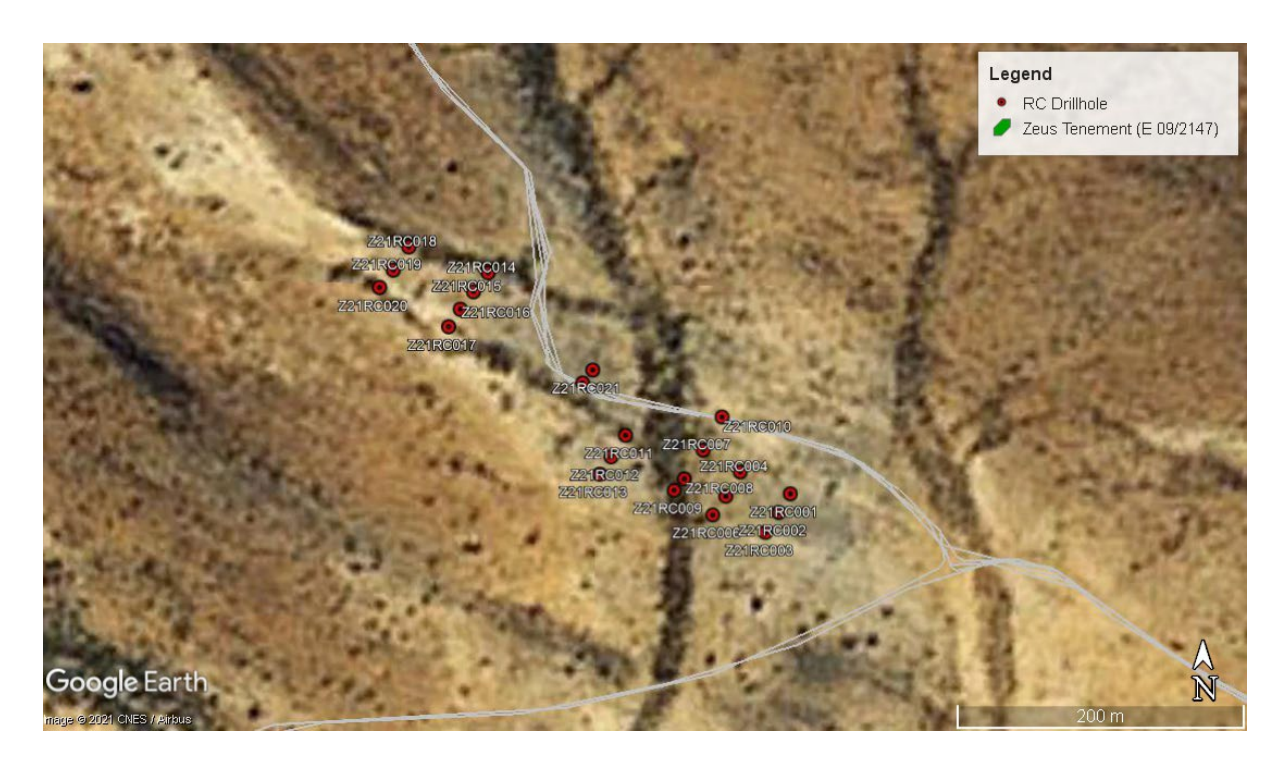
Figure 6. Reid Well drillhole locations.