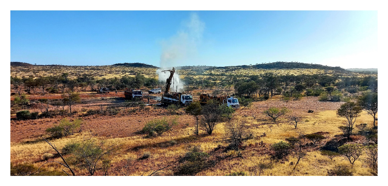
Figure 3. Drilling operations at the Reid Well Base Metals Prospect.