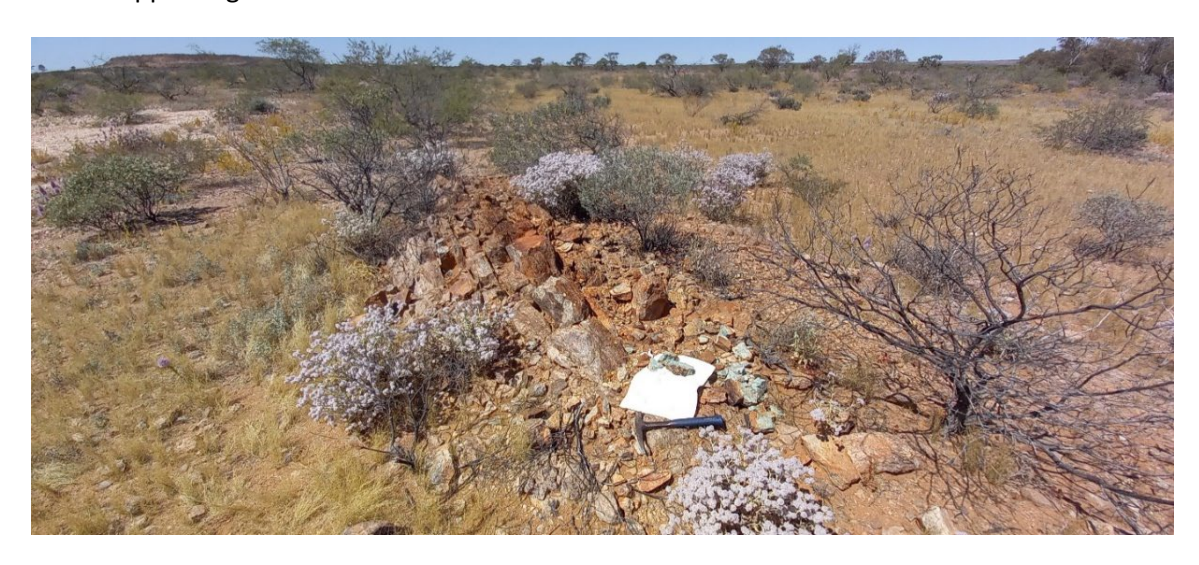
Figure 4. VMS base-metal target; exhalative malachite, chalcocite, and galena-bearing barite lens. (Sample# ZEU016; See Figure 3).

Initial geological mapping defined a main mineralised zone forming an elongate exhalative lens some 2-3m thick (Figure 4) within a quartz-biotite-chlorite-sericite schist +/- garnet, tourmaline, and magnetite zone within the Morrissey Metamorphic Suite. Disseminated copper mineralisation, in the form of malachite, azurite and chalcocite (Figure 5) outcropped for over ~100m along strike length before disappearing under cover to the northwest and southeast.