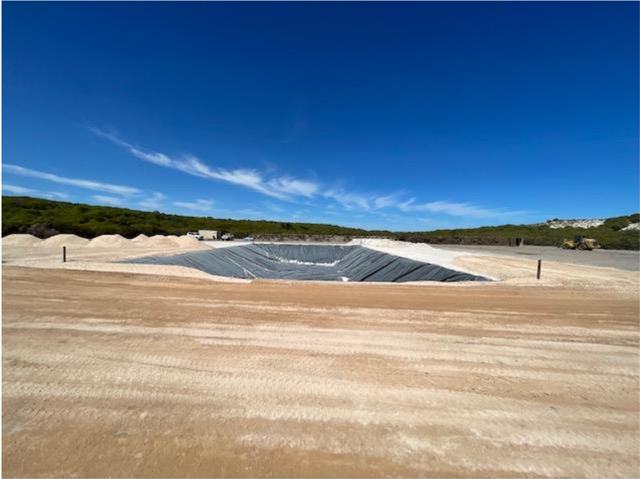
Figure: 2 Cervantes-1 Drilling Pad

The site and access road civils works was recently completed in preparation for the arrival of the Ensign 970 drilling rig at Cervantes-1. (See Figure 2 below)