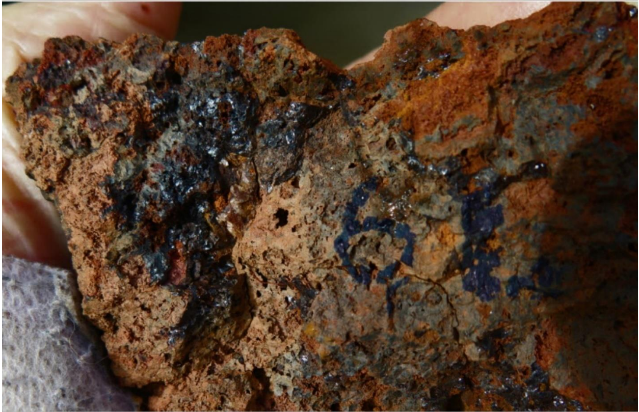
Image 2: Exposed nickel laterite at the Gunnawarra Nickel-Cobalt project

This announcement has been approved by the Board of Ark Mines Ltd.