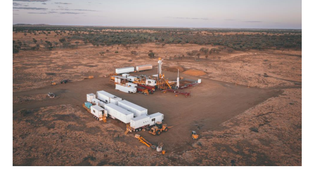
Figure 2: Silver City Rig 23 on location at Glenaras 24

The gathering and electrical cable trenching activities are scheduled to commence next week. It is anticipated that some of the existing pilot wells will need to either be turned down or shut-in for limited periods throughout the course of the current programme to ensure safe and optimal operations at all times.