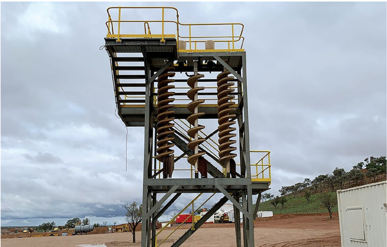
Figure 3 – Top: Gravity spiral circuit installed at the Pyrite Hill site. Bottom Left: Installation of oxygen plant at the Broken Hill site. Bottom Right: Installation of nitrogen plant at the Broken Hill site.

In Broken Hill, expansion of the leach plant continued in Q1, augmenting throughput capacity from 40 kg/hr to 125 kg/hr. Equipment for discrete unit operations are now being installed including the oxygen and nitrogen plants (Figure 3), and following, the new large-scale kiln and sulphur recovery equipment.