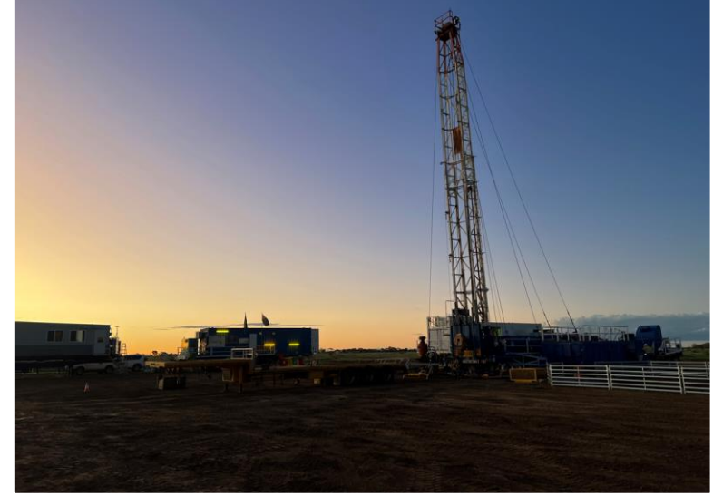
Figure 3 - Wild Desert rig set-up at Glenaras 24

The completion element of the programme has commenced, involving the running of tubing and pumps into the wells and wellhead installation. The completion work will be completed by the Wild Desert workover rig which has set up over Glenaras 24.