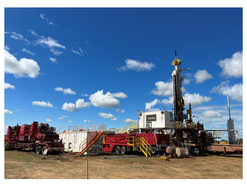
Figure 2 - Drilling rig at Glenaras 27

The drilling of Glenaras 27 has been delayed due to a second rain event last week. The two rain events resulted in the highest May rainfall experienced in the region for 30 years. The roads have dried out sufficiently to enable the rig to be moved and for drilling materials to be delivered to site.