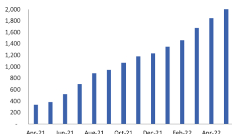
Platform customers surpass 2,000