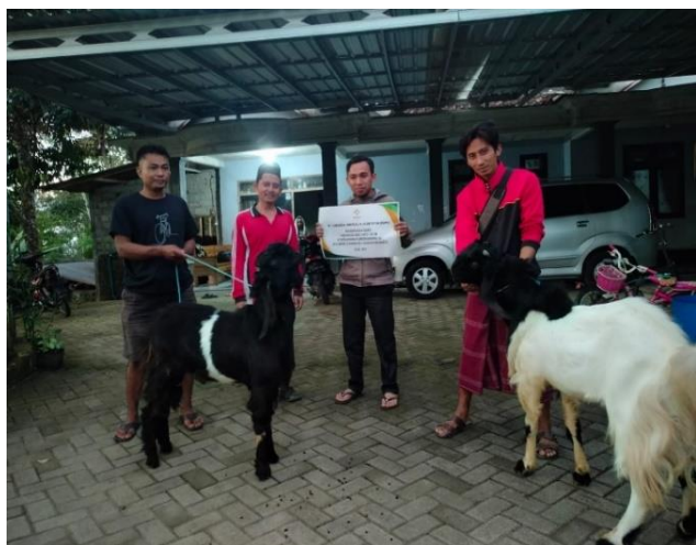
Picture 2 - Donation to orphans - Woyla

As part of our focus on supporting the community around the mine operational area, the company distributed food to 141 families in six local villages. The Company's Meugang support program for orphans, during Eid al-Adha, was the first such program to take place in Geumpang and Mane communities.