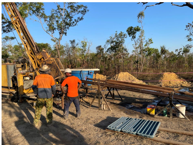
Diamond drilling at Lei – Easting 693743/Northing 8591200 (GDA 94/Zone 52)