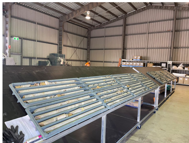
Core samples at LPM Darwin warehouse

Phase 1 encompasses three holes for approximately 600m. It is designed to build on the historic Lei discovery hole of 12m at 1.43% Li 2 O. 1 Results from Phase 1 are set to provide detailed characterisation and key structural information to support further drill planning.