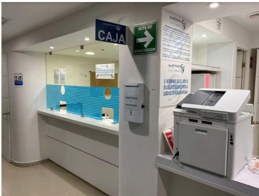
Figure 1: The waiting room in the Mexpharm clinic

Mexpharm Medical Clinical, a leader in healthcare care in Mexico, specialises in comprehensive medical care focused on the needs of patients and clinicians. It provides state-of-the-art medical technologies and doctors specialized in ophthalmology, endoscopy, gynecology-oncology, internal medicine, anesthesiology, and general medicine. It delivers competitively priced, quality short-stay medical care with high level of professional medical care. The agreement to operate the TruScreen-based cervical cancer screening centre in the Mexpharm clinic was negotiated by the Company's distributor in Mexico, Sunbird S.A. de C.V.