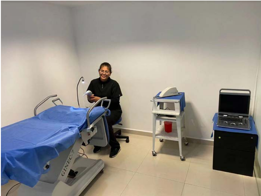
Figure 2: The TruScreen cervical cancer screening operator in the Mexpharm clinic