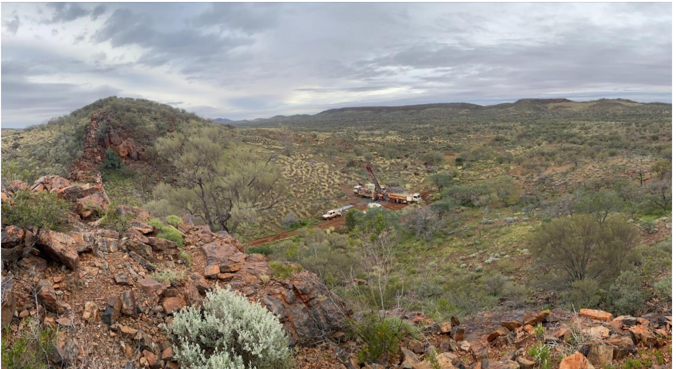
Figure 4: Image of the RC rig drilling hole REYRC009 within the High Range.

A single hole REYRC009 (153m) successfully drilled a gossanous outcrop within the High Range – where the Money Intrusion crosses a basin of Edmund Group sediments. Drilling collared into a coarse to medium grained pyroxenite intrusion before passing into an olivine and disseminated sulphide bearing unit near the contact with the underlying sulphidic sedimentary rocks. The confirmation of pyrrhotite-chalcopyrite-pentlandite mineralisation within the High Range is significant as the majority of the Money Intrusion does not outcrop within the High Range. This result indicates that the mineralisation could extend to at least ~4.5kms in strike.