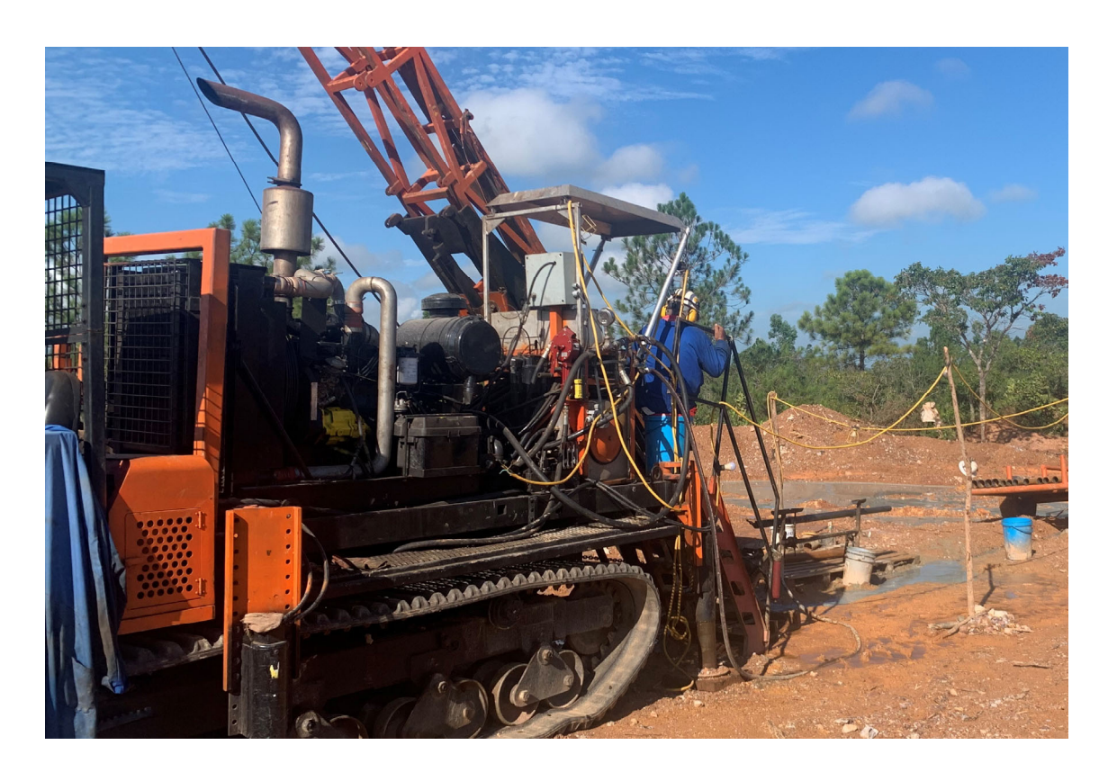
Diamond Drilling - El Pilar