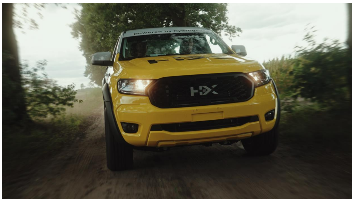
Picture of H2X's Warrego being tested in the Netherlands.

The first-release Warrego features a 60-kw fuel cell connected to a hybrid battery/supercapacitor electric drive system. This is connected to a 700-bar type 4 hydrogen tank system constructed of an advanced polymer and Carbon Fibre base which offers exceptional safety levels with very long standards of operation.