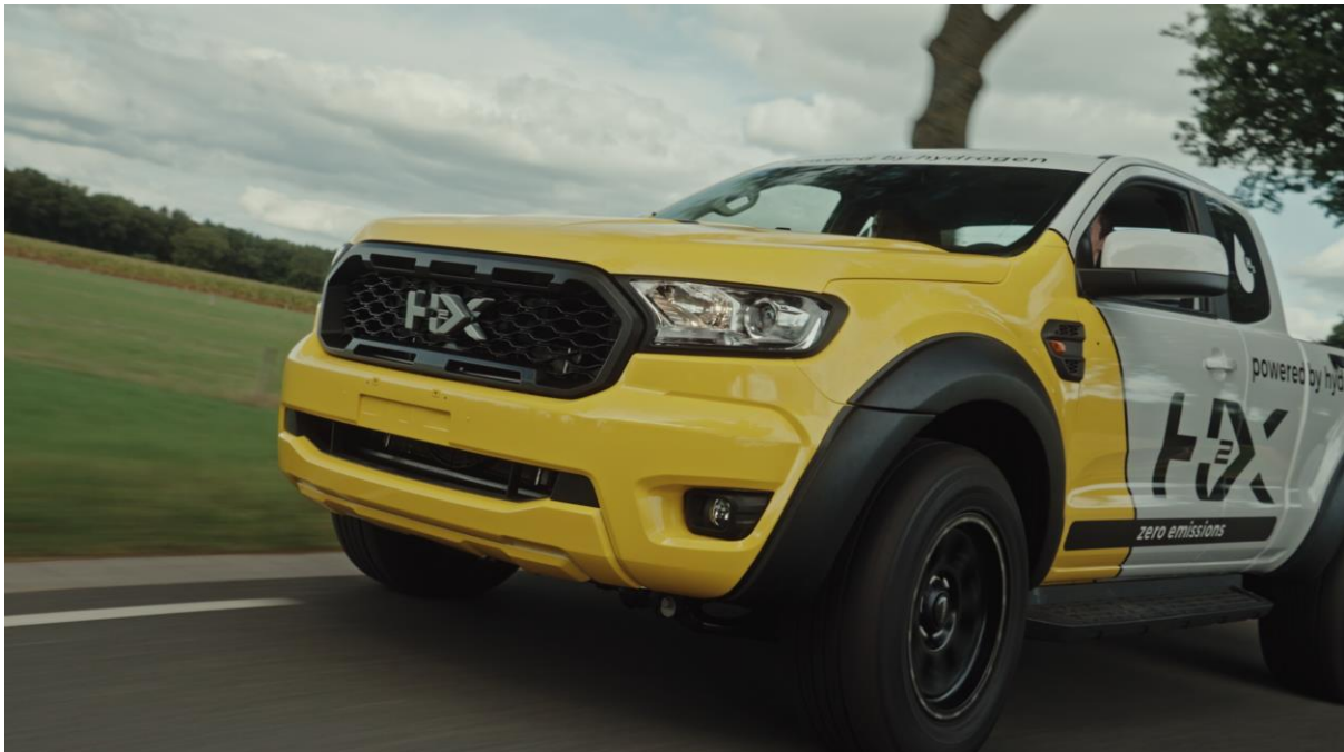
Picture of H2X's Warrego being tested in the Netherlands.