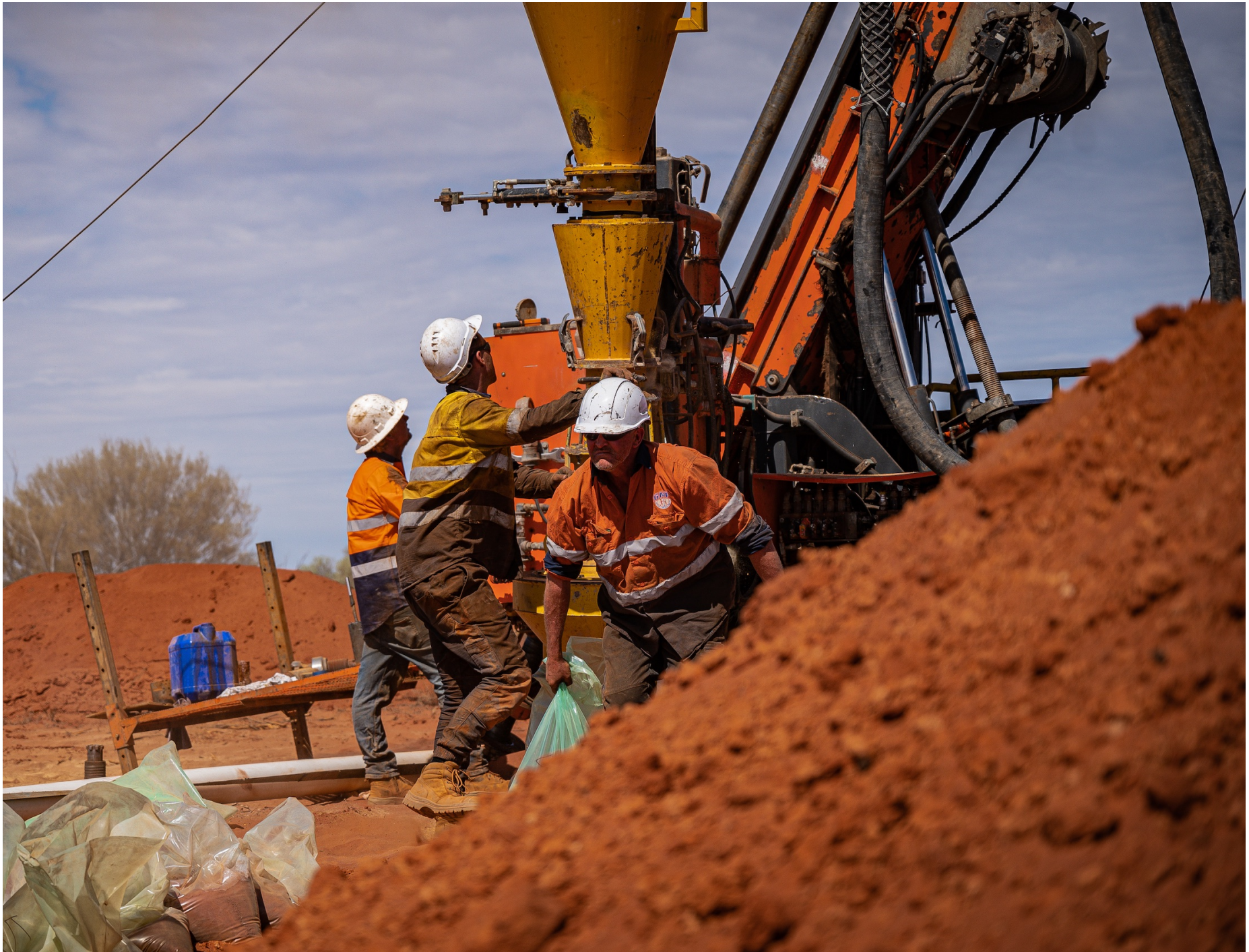
Figure 1: RC drilling underway at Aurora Tank last week