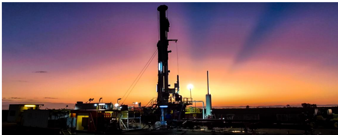
Drilling at Rougemont-3