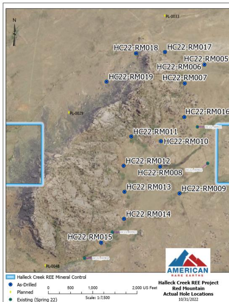
Red Mountain Drill Hole Locations as of 31 October, 2022