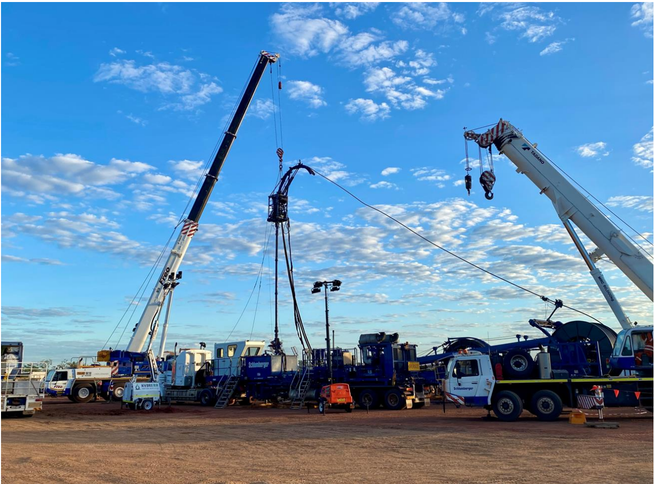
Rig up of the SLB frack spread at Carpentaria-3H

This ASX release has been authorised by the Managing Director