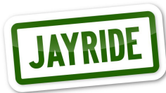
Jayride Market Share Gain (%)