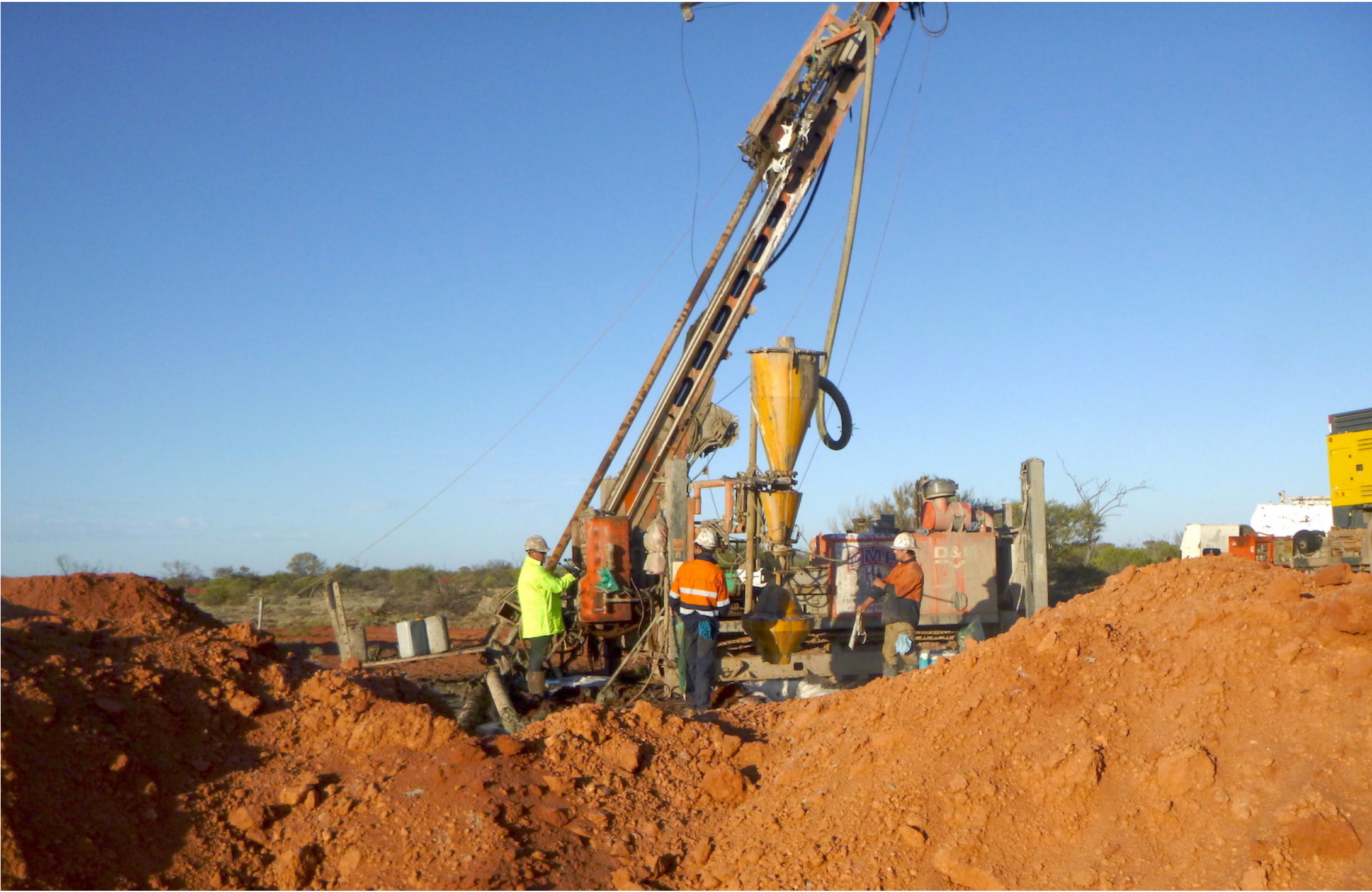
Figure 1: 2023 Drilling starts at Aurora Tank