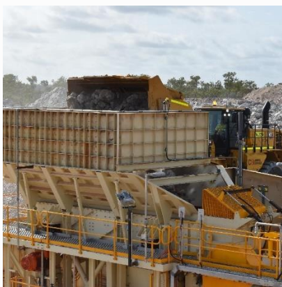
Loading the Crushing Plant

Core used a digital exchange platform to successfully tender a shipment of 15,000 dry metric tonnes (dmt) of spodumene DSO, with an average grade of 1.4% Li 2 O. The tender was offered on a CIF basis to several pre-screened participants active in the lithium-ion battery supply chain and sold for US$951/dmt. Loading of the shipment onto the Rossana commenced at the end of the quarter. Due to weather delays, the ship departed Darwin Port on 4 January 2023 for Fangcheng, China 5 . Core will account for the sales revenue from this DSO tender in its March 2023 Quarterly Report.