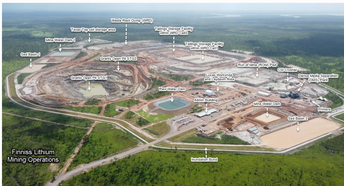
Finnis Mining Operations in the wet season (taken week commencing 9/1/23)

Australian lithium miner Core Lithium Ltd is pleased to present its Quarterly Activities Report for the period ended 31 December 2022.