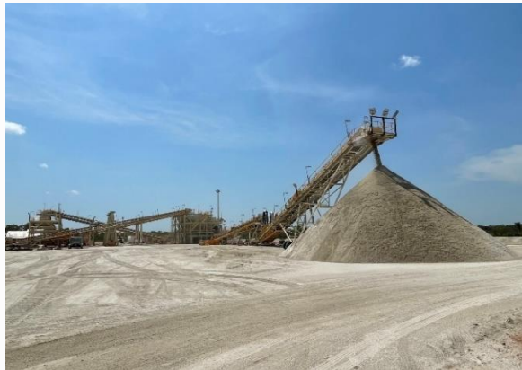
First DSO Stockpile

The DSO shipment allowed Core to commission all logistics processes and procedures between the Finniss operations and Darwin Port ahead of spodumene concentrate production.