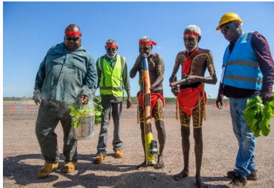
Kenbi Rangers smoking ceremony at the mine opening