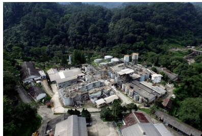
Pongkor Gold Processing Plant