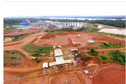
Tayan Bauxite Mine