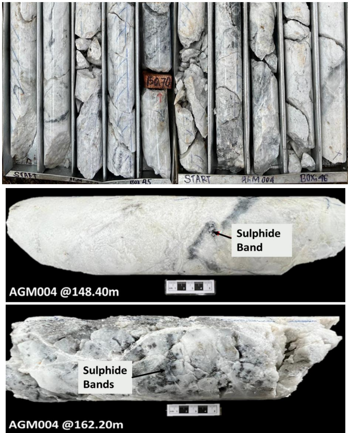
Figure 2: TOP: Part of drill core from hole AGM004 showing massive crystalline quartz with sites of finely banded crustiform-colloform quartz with black sulphides (ginguro). BOTTOM: core section showing massive quartz with occurrence of black sulphide bands. pXRF readings indicate Au concentrations of 3 ppm and up to 1,620 ppm Ag. Note that the hand-held XRF provides confirmation that mineralization is present however it is not an accurate determination of the elemental concentration within the sample analysed. The pXRF readings are subject to confirmation by chemical analysis from an independent laboratory.