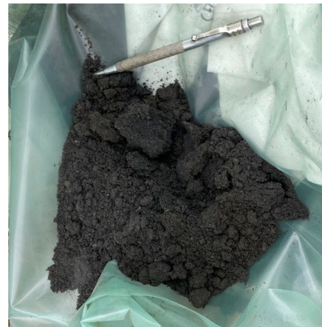
Figure 2: Koppio graphite sample