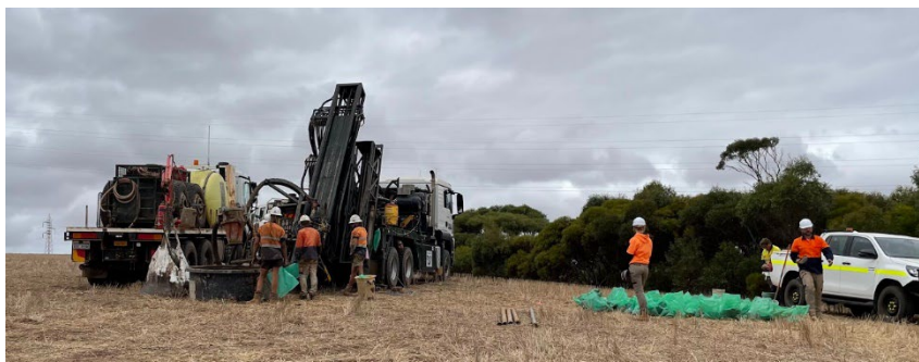
Figure 3: Drilling operations at Koppio