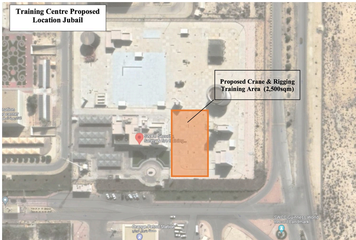
Figure 1. Fire & Safety Training Centre Jubail Overhead Image with Proposed Crane & Rigging Training Area