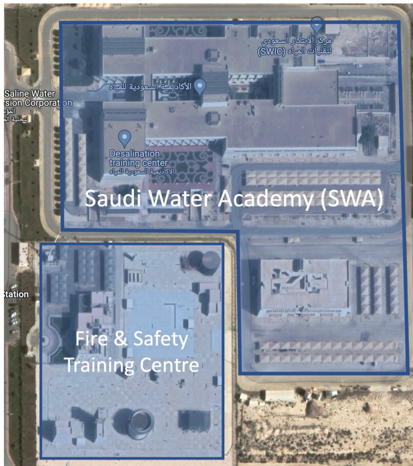
Figure 3. Saudi Water Academy and Fire & Safety Training Centre - Jubail