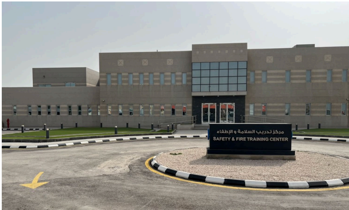
Figure 4. Fire & Safety Training Centre - Jubail

A full year summary of the revenue of each of the above project operating at full capacity is shown in the below table:-