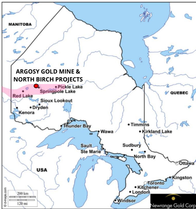
Figure 1 - Location of the Newrange Gold Canadian properties in the Birch-Uchi Belt of the prolific Red Lake Mining Division, Ontario.

The Birch-Uchi Belt is considered to have similar geology to the Red Lake Belt but has seen less exploration and is about three times larger. The North Birch Project covers a geological setting identified from airborne magnetic surveys (Ontario Geological Survey and AurCrest Gold) and interpreted as being a favourable environment for gold mineralisation.