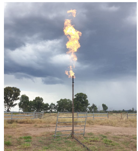
Figure 2: Flaring - 4 March 2023