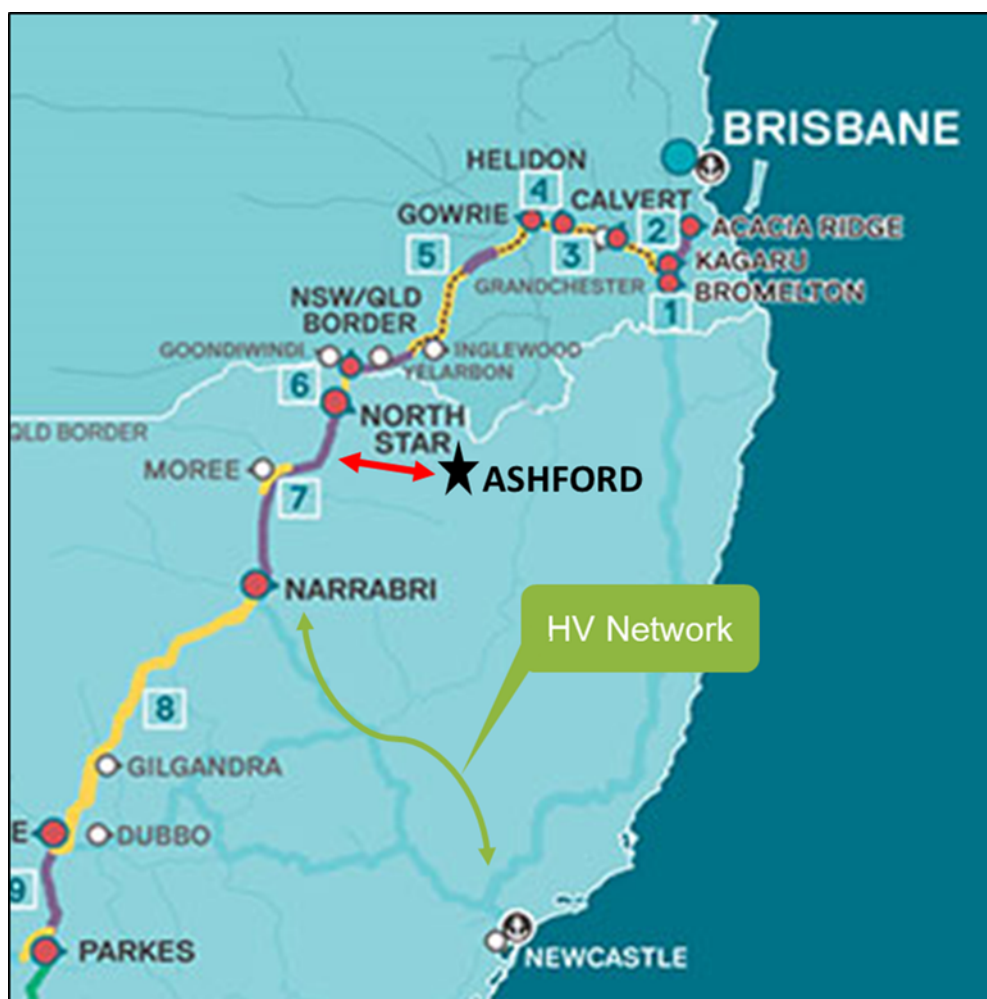
Figure 3 – Inland rail project

The Ashford Project comprises two (2) exploration tenements, EL6234 and EL6428. Both areas comprise geological features that provide potential opportunities for relatively shallow open cut coal mining.