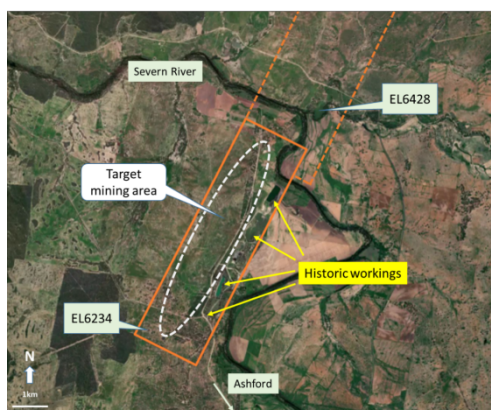
Figure 4 – Target mining area on EL6324

EL6428, to the north, will be retained on foot as an exploration tenement. Subject to the results of future exploration programs and the usual project approval processes, this area could in future be developed as an Ashford expansion or continuation Project.